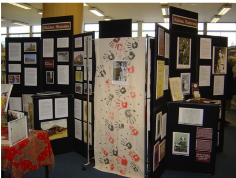
Dorset's Hidden Histories Exhibition

For secondary schools, colleges and universities we have travelling exhibitions exploring Black History in Dorset. Find out about the African American GIs who came to Dorset in 1944 to practise for the D Day landings, or the missionary who was a freed slave from the USA and settled in Bournemouth, or the slave traders who owned land in Dorset and plantations in the Caribbean and the Dorset abolitionists who campaigned against the slave trade.